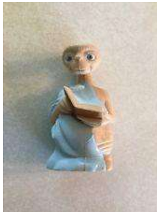
E. T. Extra Terrestrial: PVC Rubber 1982 toy “ET reading book” 14

toys, music and movies. Such materials, which proliferate from the original verbal source (but the reverse also occurs 10 ) invite our critical thought to move away from, and beyond intertextuality, and into the category of intermediality, supported by the practice of remediation 11 . Beyond visual literacy, or literary visualcy 12 , we are to encounter the multi-shaped universe where we examine books and games in unison. The aptest definition for such a vastly differentiated space seems that of the “medial constellation constituting a given media product”, as defined by Rajewsky, and earlier on by Bolter and Grusin 13 .