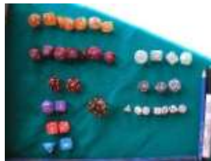
Dungeons & Dragons, dice 24 .

The responsibility of the story, however, does not only rest upon the Dungeon Master and his or her ability to enforce the rules: the element of chance comes in because a set of dice, variously shaped, is part of the game. Dice with four, six, twelve sides and even twenty-sided dice are provided.