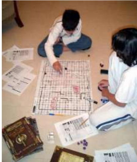
Dungeons & Dragons, players and map 21

Player characters (PCs) engage in tasks and campaigns: the Dungeon Master (DM) directing their action according to the rules; they meet on the way non-player characters (NPCs) often belonging to the category of monsters, of which the Manual gives a full list. They can be mythical creatures, such as basilisks, cyclops, dragons, ghouls, gnomes, golems, hydras, kobolds, manticores, minotaurs, medusas, ogres, specters, vampires; dangerous animals such as bats, crocodiles, giant centipedes, giant leeches, mules, snakes, wolves; dangerous substances such as gelatinous cubes, gray ooze, ochre jelly. The cover of the Rule Book entices the players with a mythical creature, a red dragon.