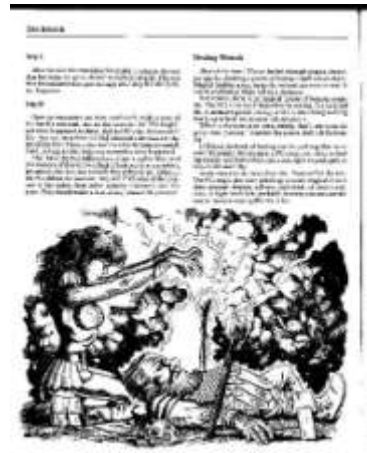
Gothic and fantasy in Dungeons & Dragons Rule Book, p. 22 and p. 28.

To conclude, we seem to have moved full circle: from branching-path books and solitaire adventures, from adventure gamebooks and role-playing games, we derive elements that transform the reader into a player, the page into a map, or a screen; the act of reading becomes, within the structure of the game, an act of symbolic agency. But the universe that such media contain, activate and explore, does not only stimulate the gaming activity of a group of players. Such games, Dungeons & Dragons being the case in point, involve each player in a creative quest, fostered by the Dungeon Master and assisted by chance. And such quest, also defined as a symbolic quest for identity, tends eventually to order all experience into a narrative pattern, that inevitably builds a life-narrative, totally new and personal yet also generated along old models, within fantastic old stories contained in old books.