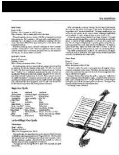
Dungeons & Dragons, Rule Book: a book of spells, p. 31. By kind permission of Wizards of the Coast.