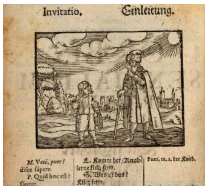
Comenius, Orbis Sensualium Pictus 2

Within the historico-philosophical boundaries that define the evolution of the book, as well as the parallel evolution of reading and of the reader, the value of the word “evolution” is not entirely established, nor granted 1 . Conventionally, readers seem to grow, to evolve, from the young consumers of the illustrated pages of the first ABCs, into older and more skilled book users, who can decode words ordered in columns and chapters in grammars and primers, and appreciate stories told with pictures and words. John Amos Comenius’s 1658 Orbis Sensualium Pictus , with its inviting caption “ Veni, puer! ” manifestly welcomed a child into an illustrated universe, where images took precedence over the written text.