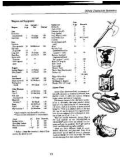
Dungeons & Dragons, weapons. Rule Book, p. 13.