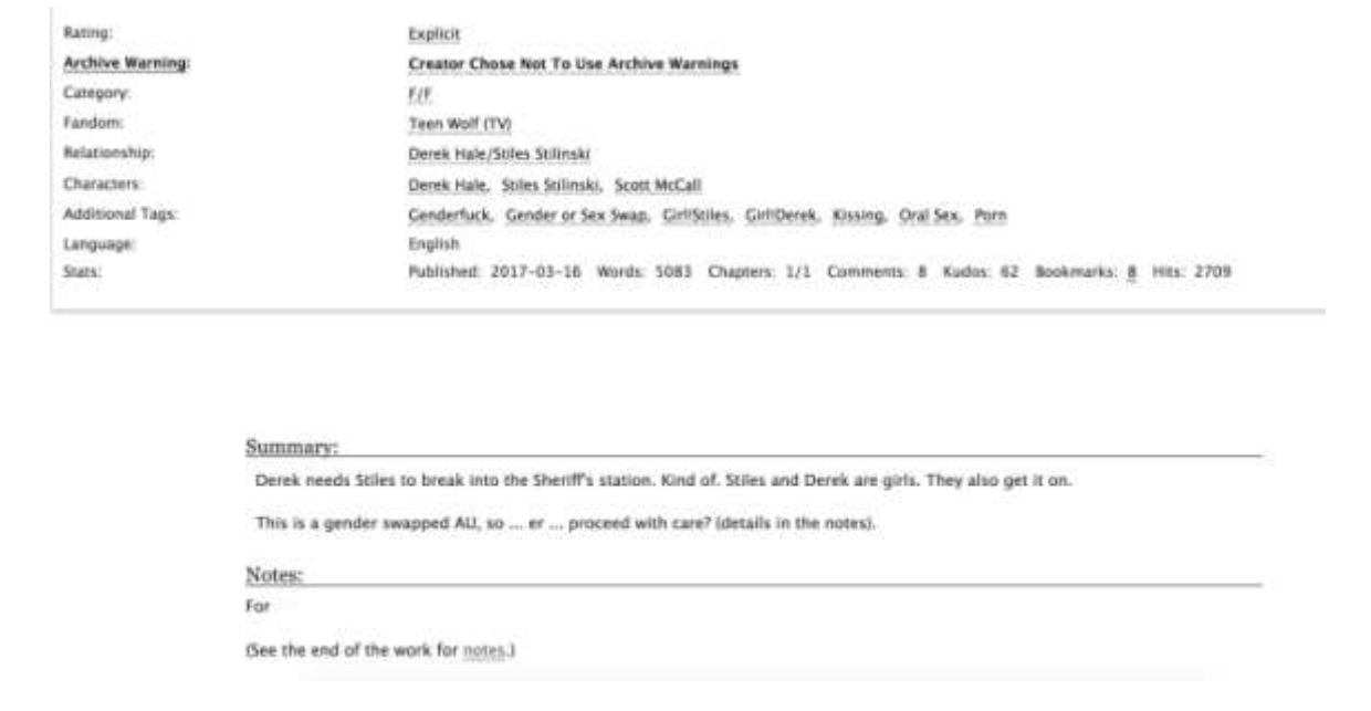
Figure 2: Description of a 'Sterek' fanfiction on the archiveofourown platform

Our Own . It is summary of a work that belongs to the fandom of a TV show called Teen Wolf (fourth in terms of popularity on Archive of Our Own). The two characters most often written about in that particular fandom are Stiles (a human boy, best friend of the main character) and Derek (a werewolf and initially an antagonist, then an ally of the main character). There are many fans, who, due to the two characters on-screen chemistry, want them to be romantically involved. This is called 'shipping' (from the word relationSHIP). The relationship never escalates into a romantic one in the original series. The combined name of this 'ship' is Sterek (Stiles+Derek) and out of the 96 263 Teen Wolf fan-works on Archive of Our Own in March 2018, 51 975 are Sterek.