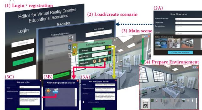
Figure 2. Defining the VR actions of a pedagogical activity

We have developed a prototype of a scenarios' editor that facilitates the creation of new pedagogical scenarios. The objective is to allow the creation and adaptation of the different components of a pedagogical scenario, in particular the learning environments, pedagogical activities and their organization.