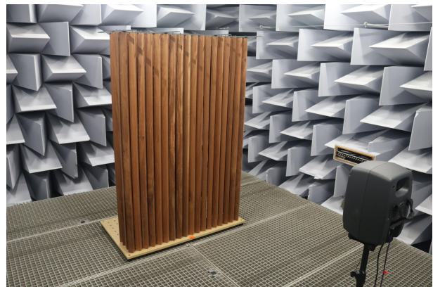
Figure 2. Anechoic room experiment

available basements. Industrial contracts signed at the outset of the laboratory provided most of the equipment and operational costs. A whole apparatus of precision measurement, mainly analog, was acquired, and a system of connections between the rooms of experiments was set up to allow for shared use. Other infrastructures and means were established on the campus during this period, including the Acoustics department (independent of the LAUM) of the Centre de Transfert de Technologie du Mans (CTTM) created in 1992. It was equipped with a large anechoic room (1000 m 3 ) coupled with a reverberation room. The engineering school (ENSIM) created in 1995 also had rooms for optical holography, vibrations, and microtechnologies integrated into the LAUM. Equipment dedicated to teaching was also established, including that of the Bac+2 course of study (DEUST "Vibration, Acoustics, Signal") created in 1990, which has trained over 500 technicians in acoustics in 20 years of existence and was highly valued by industrialists.