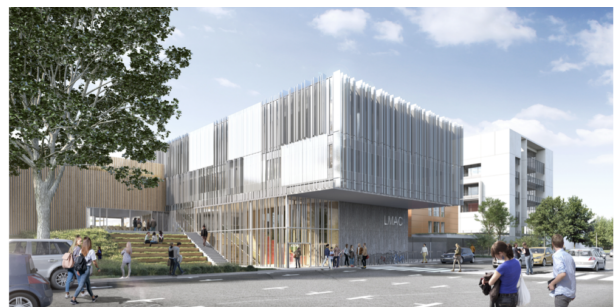
Figure 5. The future Acoustics building (in the background, the LAUM building of the Faculty of Sciences)

Since 2014, the LAUM has been working towards bringing together the various actors of acoustics in Le Mans under one banner. This effort has resulted in collaborations with the Institut Technologique Européen des Métiers de la Musique (ITEMM), the Superior School of Art and Sound Design of Le Mans, and the Centre de Transfert de Technologie du Mans (CTTM) for research, development, and training. It has also partnered with cultural organizations in Le Mans for "art and science" projects. In collaboration with the City of Le Mans, this consortium of acousticians has created an event for the general public called "Le Mans Sonore". This event, which combines science and culture, has now become an international biennial of sound. The third edition of this biennial will take place in January 2024, featuring unusual visits of the laboratory, exhibitions for the general public, and scientific workshops. Sound artists and designers are also invited to participate and highlight certain aspects of LAUM's research.