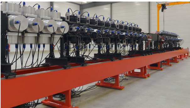
Figure 4. The test section of the "Maine Flow" aeroacoustic bench

The growth of the LAUM has also led to an expansion of its facilities. In the early 1990s, the ENSIM building and the physics building of the Faculty of Sciences were constructed. Currently, a new building is being built that will include additional experimental surfaces, new rooms dedicated to acoustics training, and a space for scientific dissemination/exhibition. Moreover, a new Techno-Campus "Acoustics and Matter" building is near completion, with delivery scheduled for September 2023. Its purpose is to house industrialists who wish to set up their businesses near the University's research laboratories. The building will include two of the LAUM's major facilities: the 3DVIB platform, which consists of three laser vibrometers mounted on a robotic arm for measuring complex vibration fields on large structures, and the MAINE FLOW multimodal aeroacoustic test bench for studying the interactions between acoustic materials and flows under conditions close to those encountered in an aircraft engine (Mach 0.6, 150 dB).