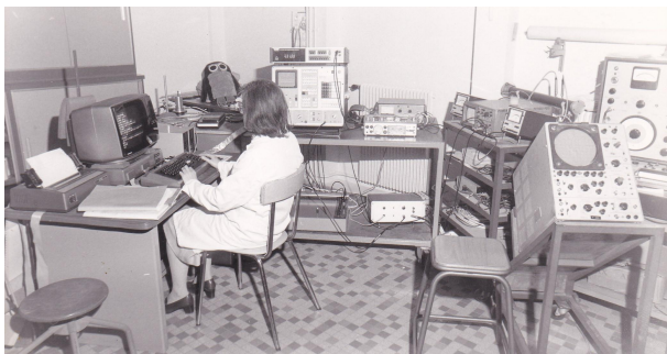
Figure 1. An experimental room of the LAUM in the 80s