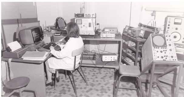
Figure 1. An experimental room of the LAUM in the 80s