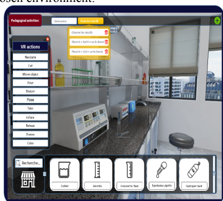
Figure. 4. Definition of the RV actions to be realized in pedagogical activity

types of views (2D or 3D). In the following steps, objects are selected from the inventory and placed in the chosen environment.