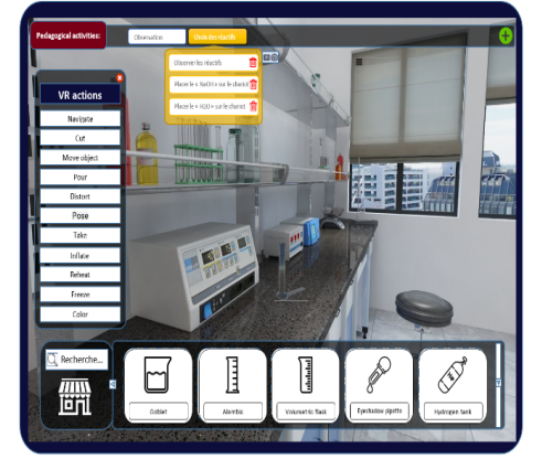
Figure. 4. Definition of the RV actions to be realized in pedagogical activity

types of views (2D or 3D). In the following steps, objects are selected from the inventory and placed in the chosen environment.